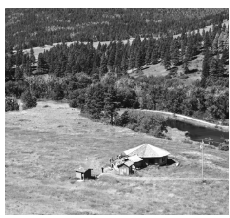
Blacktail Ranch, MT

I entered certification with eyes wide open, feeling that, as with any profession, it is important to have a deep understanding and belief in what you are offering. References to "mindfulness" practices are quite common. What makes iRest different? As someone familiar with the study of mindfulness once said, "iRest is like mindfulness on steroids!" Therapeutically speaking, iRest is different to other mindfulness practices because it proactively addresses specific