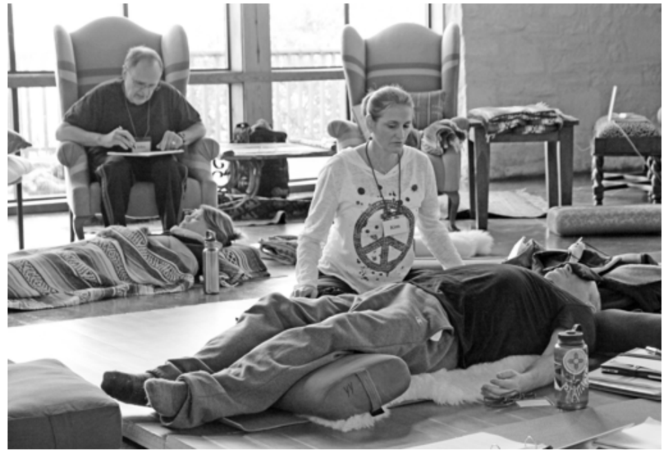
Participants practicing the iRest protocol in dyads.

iRest certification, unlike the physically attended and teacherled Level I and II trainings, is a comprehensive process carried out independently with the support of a self-selected supervisor.